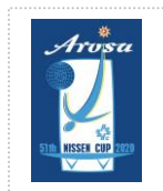
FIG TRA WORLD CUP - 51ST NISSEN CUP AROSA - SWITZERLAND 3-4 JULY 2020